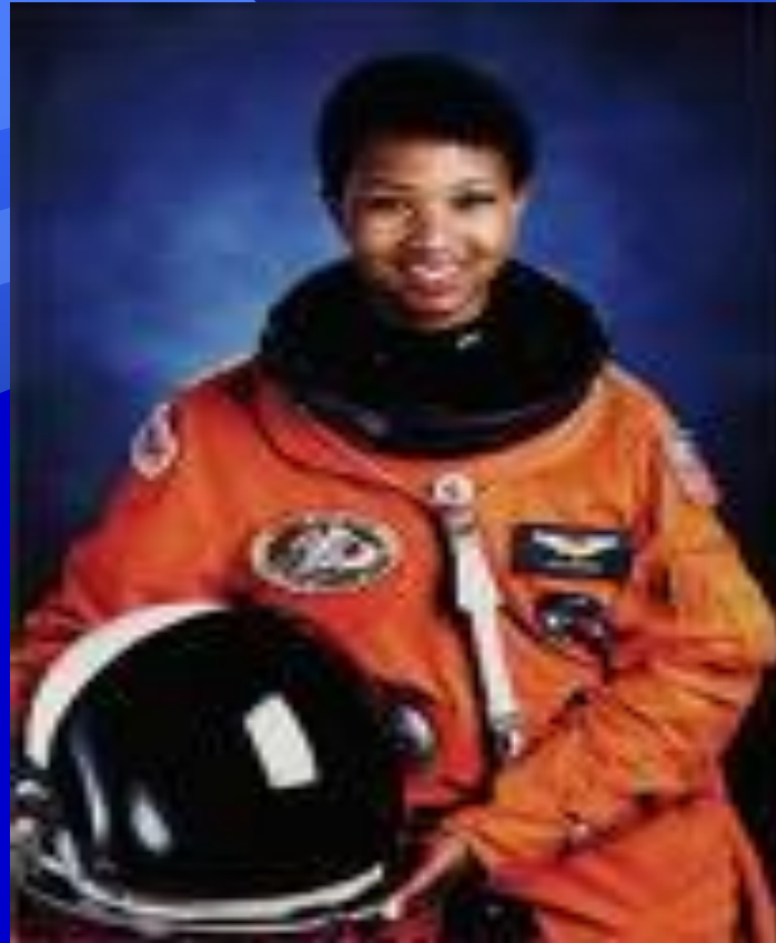
Dr. Mae Jamison